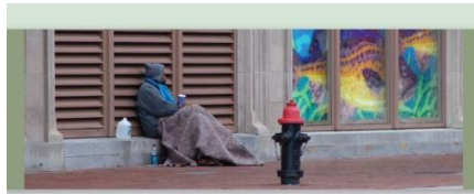
CRUEL, INHUMAN, AND DEGRADING: Homelessness in the United States under the International Covenant on Civil and Political Rights

Earlier this week, the National Law Center on Homelessness & Poverty released to the public a report, "Cruel, Inhuman, and Degrading: Homelessness in the United States under the International Covenant on Civil & Political Rights," addressing concerns raised by the U.N. Human Rights Committee in its review of the U.S.